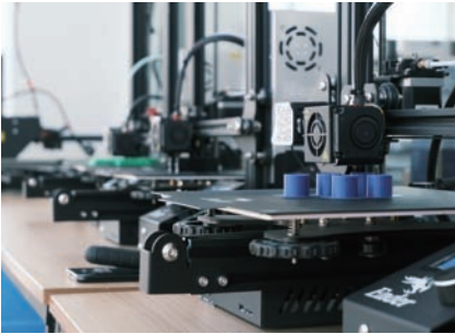
机械设备 Mechanical equipment