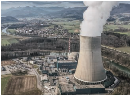
核电 Nuclear power