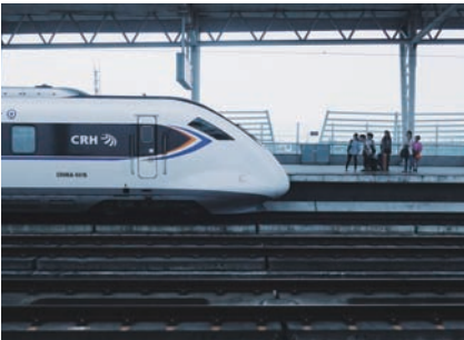
高铁 High-Speed Rail

Tenglong Group provides products for many industries, and the products are widely used in key industries and major projects in domestic and abroad, including the fields of high-speed rail, nuclear power, communications, electronic appliances, new energy, mechanical equipment, petrochemical, medical equipment, curtain wall construction, aerospace, shipbuilding, etc.