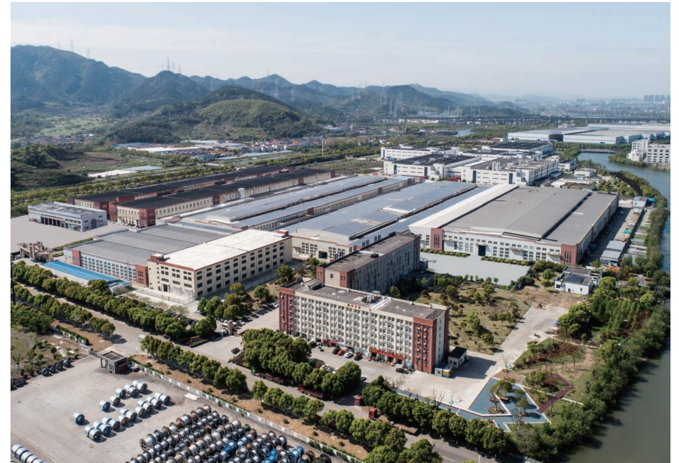
宁波腾龙基地 Tenglong Base (Ningbo)

Tenglong Stainless Steel Products Group (hereinafter referred to as: Group) was founded in 1986. Now the company owns two production centers in Ningbo and Shandong, and also has more than ten wholly-owned and holding companies under its jurisdiction. It mainly involves in stainless steel wire processing, equipment manufacturing, steel trading, information technology and other industries. Tenglong group is one of the top 500 private manufacturing companies in China, which is well-known in the industry for years.