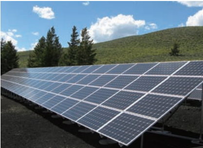
新能源 New energy